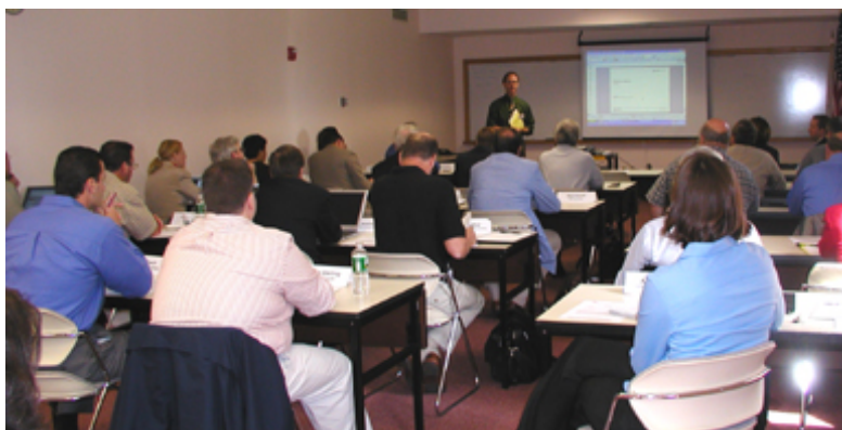
Presentation at MTC explains the City of Boston's plans to achieve an open wireless broadband infrastructure

For more than seven hours, before two different groups, Vantzelfde discussed in mesmerizing detail recommendations adopted by Boston's Mayor Menino on July 31 to deliver wireless broadband services to Boston's entire city footprint. ( Link to presentation. )