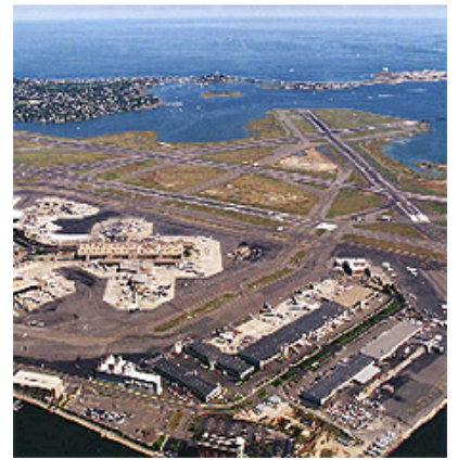
Border crossings, seaports and airports such as Logan, above, are slated to receive new detection systems based on a new technology application developed by a Massachusetts research center.